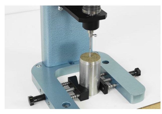
Vane Apparatus (27-WF17D30) fitted with holding sampling tube (27-WF1738) and sample container.

Optional attachments to accommodate the use of sample tubes up to 100 mm, sample jars or special container are available. This will hold the container rigid relative to the apparatus eliminating any errors during the test.