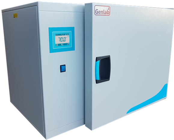
Model Shown - INC/100/TDIG/F