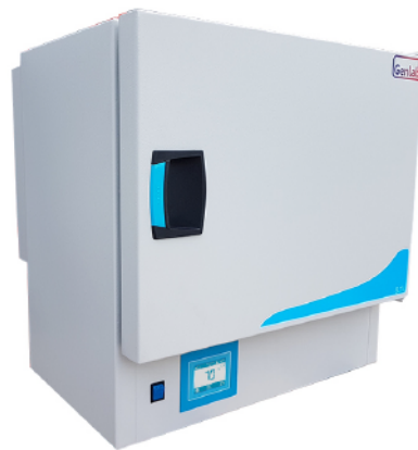
Model Shown - MINI/50/TDIG/F

The Genlab range of Benchtop Incubators offers a selection of highly efficient, reliable and cost effective incubators to suit most biological analysis, research and general laboratory applications. Available in a variety of sizes and designed with both side or base mounted displays to suit your exact needs. They feature our latest touch screen control system which offers intuitive control and excellent accuracies designed for laboratory incubators.