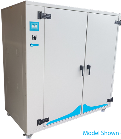
Model Shown - LCI/750H/TDIG