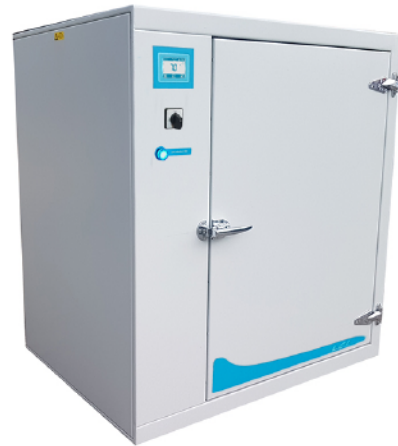
Model Shown - LCI/425V/TDIG

The Genlab range of Large Capacity Incubators offers a selection of highly efficient, reliable and cost effective units. They are suitable for larger applications of incubation, research and general laboratory applications. Featuring our latest touch screen control system which offers intuitive control and excellent accuracies designed for laboratory incubators.