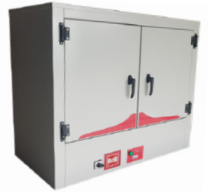
Model Shown - LCO/250H/TDIG

The Genlab range of Large Capacity Ovens offers a selection of highly efficient, reliable and cost effective ovens to suit most warming, drying and heat treatment processes. They feature our latest touch screen control system which offers intuitive control and excellent accuracies designed for industrial and laboratory ovens.