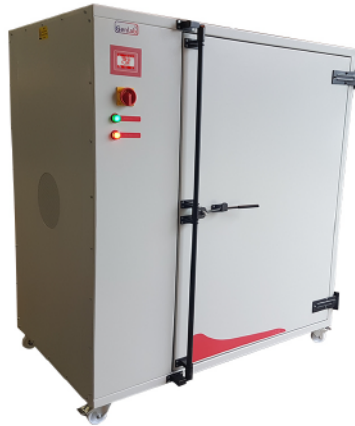
Model Shown - LCO/750V/TDIG