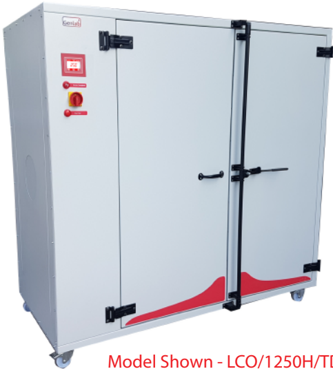
Model Shown - LCO/1250H/TDIG/AWA