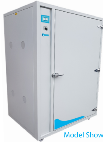
Model Shown - PRI/650V/TDIG

This range of Prime XL Incubators are the flagship brand of Genlab Incubators. They are built to the highest standards and packed with features and enhancements. As standard, the Prime XL range offers a mirror polished stainless steel interior, increased accuracies and an extended temperature range of 100.0°C. Built around a heavy duty panelled framework, we can offer increased load capability in this range and multiple reinforced shelves. It features our latest touch screen control system which offers intuitive control designed for laboratory and industrial incubators.