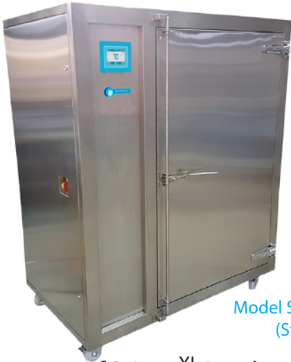
Model Shown - PRI/750V/TDIG/SSE (Stainless Steel Exterior)