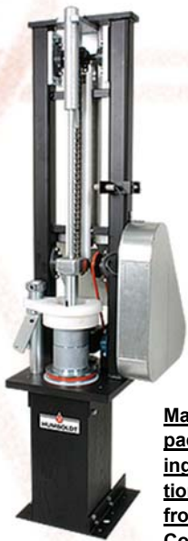
Marshall Compactor, Auto, Rotating Mold Configuration, Heavy Duty from Humboldt Mfg. Co.