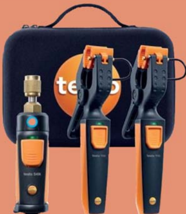
Testo Smart Probes

Aralab has a range of climatic test chambers that are fully user-oriented. testchambers; Metrology - temperature and humidity calibration; Solar panels testing .etc..