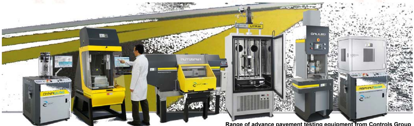
Range of advance pavement testing equipment from Controls Group

Manufacturer of Non-destructive Testing Equipment such as Schmidt Hammer, Equotip Hardness Tester, Resistivity Meter to test resistivity of concrete, Rebar Locator (Profometer), Canin Corrosion Analysis Instrument, Torrent Permeability Tester, Dyna-Extraction Tester to measure pull-out force on anchored bolts, TICO Ultrasonic Instrument for Testing Concrete Components