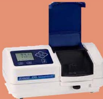
Spectrophotometer 6305 supplied by Bibby Scientific

Manufacturer of Stuart, Techne, Jenway and Electrothermal brand of products. Applications for the products are diverse and include areas such as medical, pharmaceutical, food manufacturing, agricultural, water related