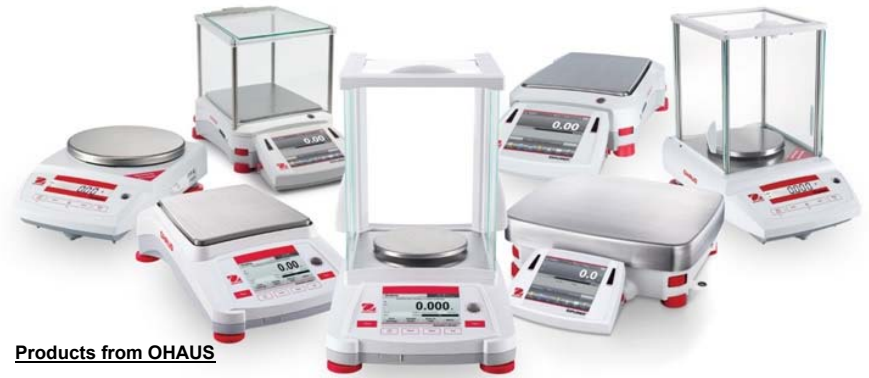
Products from OHAUS

Manufacturer of Mechanical Scales, Electronic Balances and Standard Weights. A wide range of products is available including portable electronic balances, Heavy Duty Balances, Moisture Determination Balances, Industrial Balances, Analytical Balances, etc. The Discovery, Analytical, Voyager, Explorer and Adventurer Series Balances are high precision top loading with interchangeable display/key pad controllers. A range of certified calibration weights are available from Ohaus.