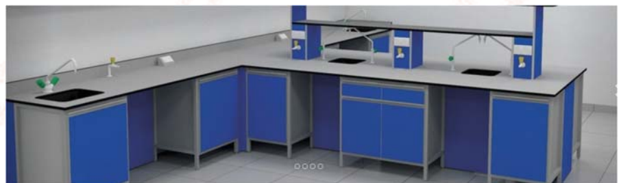
Laboratory Furniture by Zeba Labs

Designing, Manufacturing and Installation of Laboratory furniture & Fume hoods. Completed More than 500 projects spread over 25 Nations.